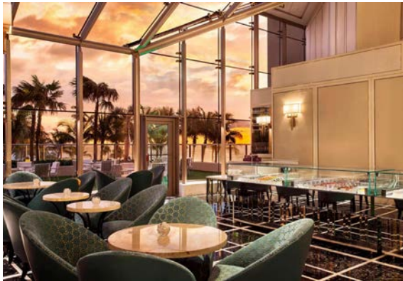
ONE OF THE DINING SPACES AT ST REGIS BAL HARBOUR

Visitor numbers are dramatically lower than South Beach and the demographic is more international, more design-oriented and possibly more attuned to privacy rather than spectacle.