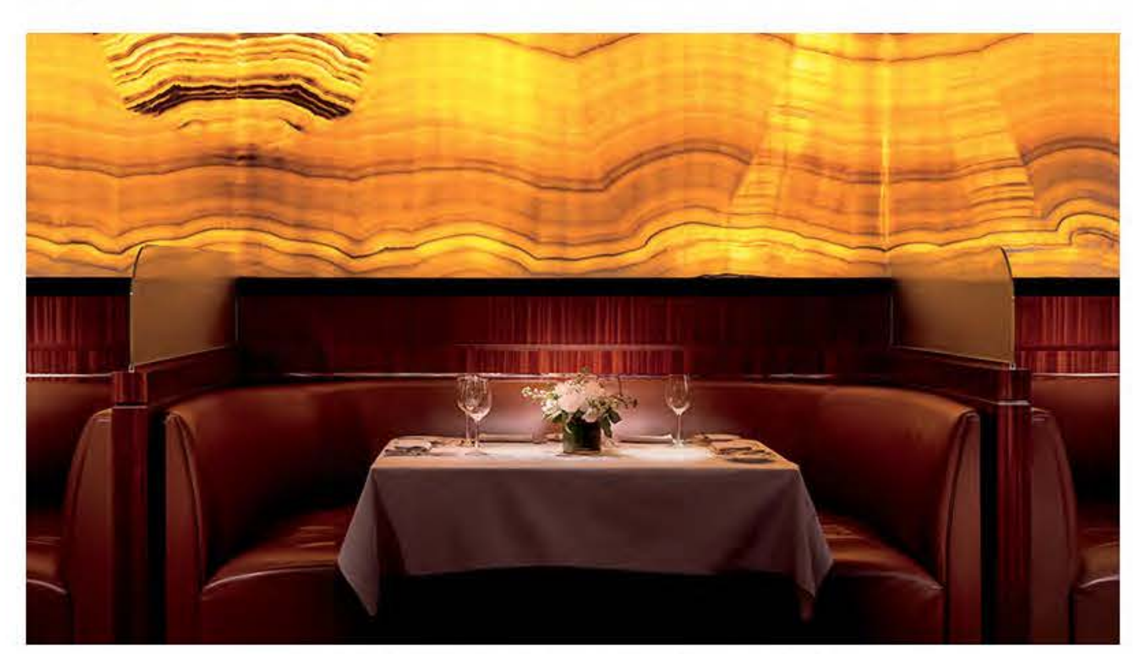
Dining at The Ritz-Carlton, Denver.

Between bites, rest up at Five-Star The St. Regis Bal Harbour Resort, where on the final night of the four-day fest, you'll enjoy a formal gala on the gorgeous Ocean Terrace, followed by a collaborative dinner presented by all six chefs.